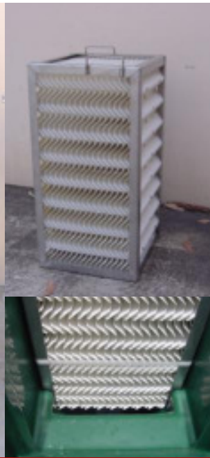
Plate Pack detail