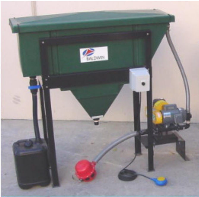
MPV-12 CPS with pump, pump stand & waste oil tank