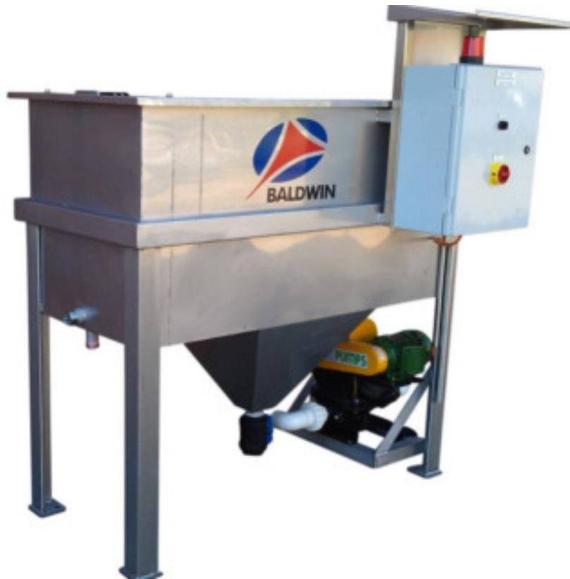
BBSV with integrated panel & pump

Designed and built in Australia by Baldwin Industrial Systems